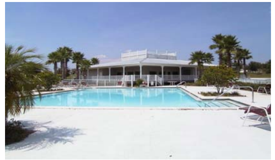
Community pool, 1 min walk from villa