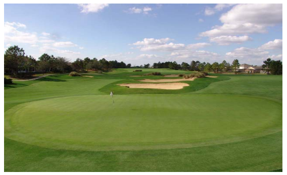
Southern Dunes Multi award winning Golf Course