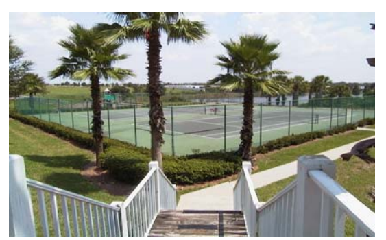
Community tennis courts