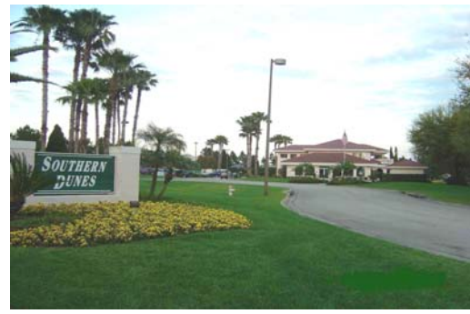
Southern Dunes entrance 24 Hour, 7 day a week gated security

Plus easy reach to shopping malls where you can shop till you drop including Eagle Ridge Mall which is just 10 minutes drive away.