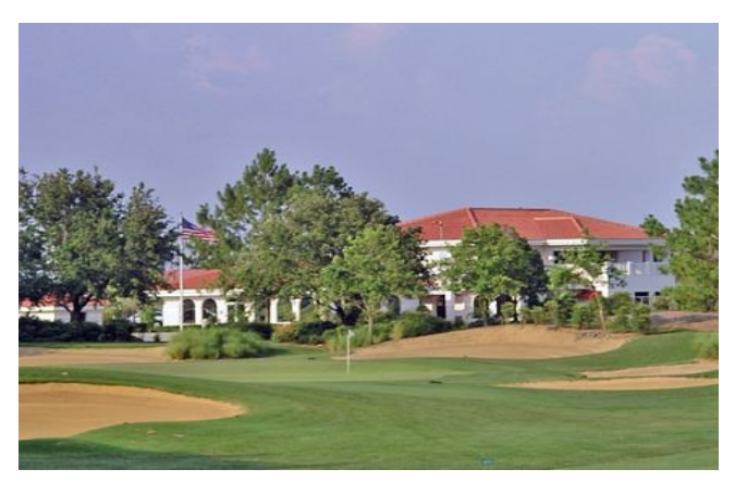
Southern Dunes Golf and Country Club

Dunes Golf and Country Club. A beautiful landscaped area, lined with palm trees, just 18 minutes from Disney Theme Parks and only 50 minutes from the sandy Gulf coast beaches.