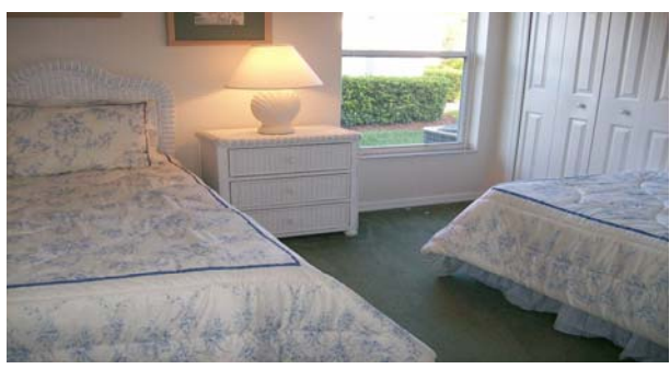
2 x master bedrooms