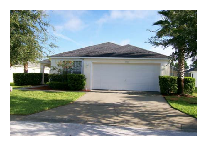
Front of villa

As a guest staying in our villa, you will also be eligible for free use of the other features within the Southern Dunes Golf & Country Club. These include 3 communal swimming pools, tennis courts, gym, library and children's adventure playground. For anglers why not try fishing at Lake Joe?