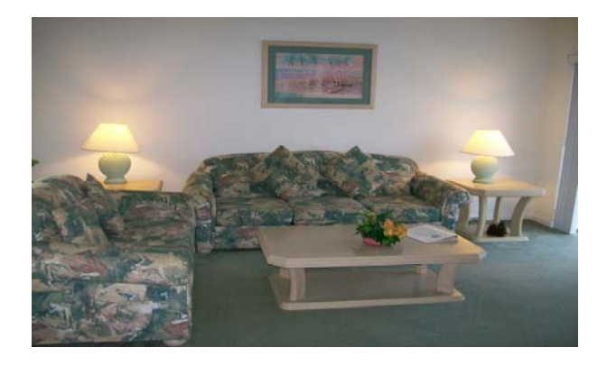
Living area Complete with TV, DVD and hi-fi unit

Adjoining the Family room is the breakfast nook, furnished with a table and four chairs. From the breakfast area there is access to the fully equipped kitchen with four bar stools situated at the breakfast bar.