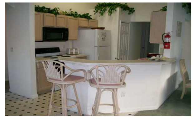
Kitchen area Complete with all mod cons.